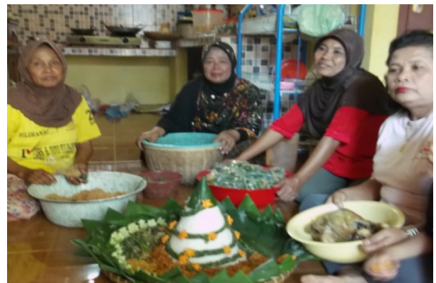
Figure 5. The women while cooking in Suroan tradition