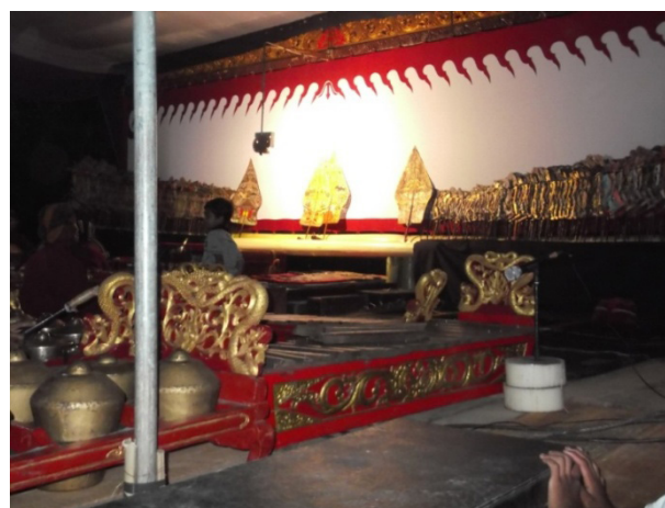
Figure 3. Puppet Performance in Bangunharjo's Hamlet

Puppet performance is always done as the closing event in Suroan tradition. The performance is started on night after riungan with accompaniment of Javanese songs and gamelan. Puppet is chosen as the closing performance because it is one of the cultures that often staged in Indonesian culture.