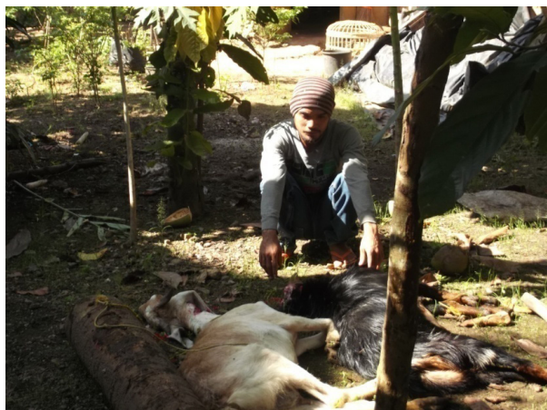
Figure 2. Goat's slaughtering