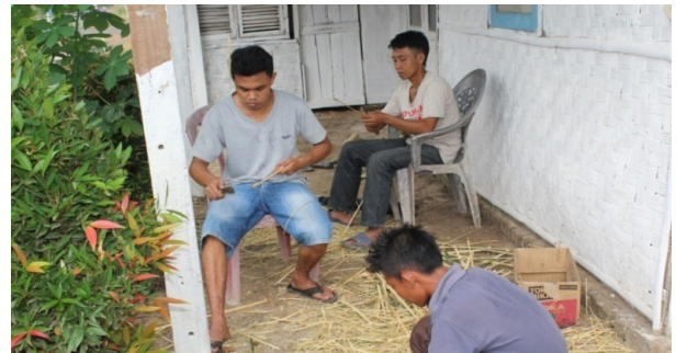
Figure 4. The society of Bangunharjo is helping each other in Suroan preparation

the market to buy cooking needs and the evening before the event in the morning the cooking activity starts until it is finished.