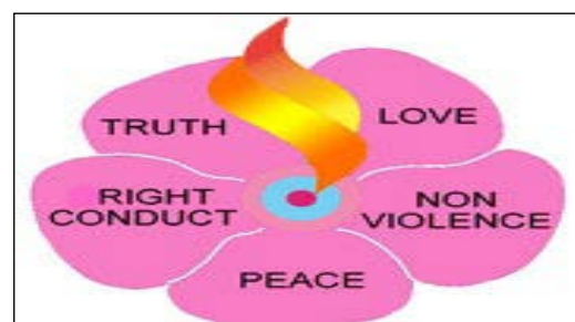
Figure 3. Sustainable Human Values

Work realization: To do something in an organized way. Our aspirations can be achieved by setting the right goals in the right direction. It is essential for the success of any human endeavor that values and skills complement each other. For instance, I want to live a healthy life. Only wishing for good health will not be enough to keep me fit and healthy and without understanding what health means, I won't be able to choose things that will keep me healthy. We want things because we think they will make us happy. It is only through self-exploration that we can find answers to many fundamental questions of all human beings. We are born as humans and should accept ourselves as such. We should learn to be happy with who we are. We should not try changing ourselves or others. We must learn to love ourselves and each other unconditionally. This enables people becoming aware of their natural acceptance Figure 3.