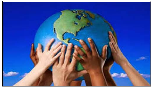
Figure 2. Universal Human Values

The ideals a student develops morally are influenced by their family and society. The relationship that children have with their parents shapes their personalities. Values are established on the foundation of the family. Children are raised with moral values such as honesty, joy, peace, fairness, which serve as principles and standards that direct their behaviour throughout their lives. The family influences how a child views other people and society, aids in the development of the child's mind, upholds his moral principles. A joyful and blissful home environment fosters the growth of love, affection, tolerance, charity. Since children spend the majority of their adolescent years with their parents, only family engagement can correct the child's behavioural issues. Family values lay the groundwork for how kids learn, develop, interact with the outside world. The child is able to maintain his convictions despite others' attempts to persuade him otherwise thanks to the family's principles Figure 2.