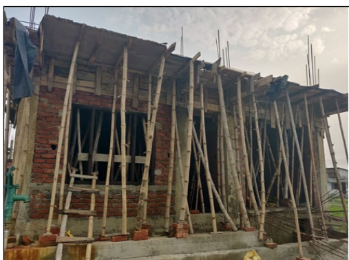
Figure 9. Field observation at site 8

Site 8: The construction work of RCC slab for building was observed at Arjundhara Municipality, Jhapa. Use of Maruti cement was noted and mixing type was manual. The first concrete mixing time was noted as 8:15 PM and the last placing time was noted as 9:43 PM. Elapsed time of 88 minutes was calculated by the difference between first mixing time and last placing time. Plasticizer was not used.