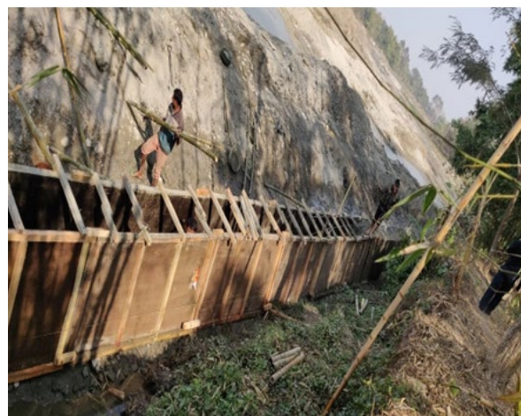
Figure 10. Field Observation at site 2

observed at Shivasatakchhi Municipality, Jhapa. Use of Jagadamba cement was noted and mixing type was Mechanical. The first concrete mixing time was noted as 10:40 and the last placing time was noted as 10:47 AM. Elapsed time of 07 minutes was calculated by the difference between first mixing time and last placing time. Use of plasticizer was noted.