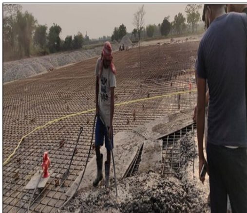
Figure 8. Field observation at site 7

Site 7: The construction work of RCC raft for industry was observed at Mechinagar Municipality, Jhapa. Use of Jagadamba cement was noted and mixing type was mechanical. The first concrete mixing time was noted as 1:35 PM and the last placing time was noted as 2:09 PM. Elapsed time of 39 minutes was calculated by the difference between first mixing time and last placing time. Plasticizer was not used.