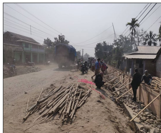
Figure 2. Field observation at site 1

Site 2: The construction work of building structure (tie beam) was observed at Arjundhara Municipality, Jhapa. Use of Century cement was noted and mixing type was Mechanical. The first concrete mixing time was noted as 4:28 PM and the last placing time was noted as 4:48 PM. Elapsed time of 20 minute was calculated by the difference between first mixing time and last placing time. Plasticizer was not used.