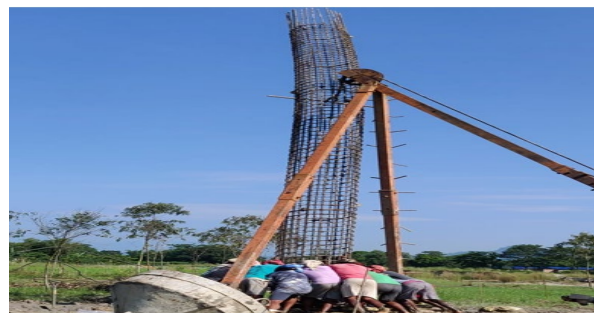
Figure 11. Field observation at site 9

Site 11: The construction work of concrete block casting was observed at Buddhashanti Rural Municipality, Jhapa. Use of Shivam cement was noted and mixing type was Manual. The first concrete mixing time was noted as 10:28 PM and the last placing time was noted as 03:30 PM. Elapsed time of 122 minutes was calculated by the difference between first mixing time and last placing time. Plasticizer was not used.