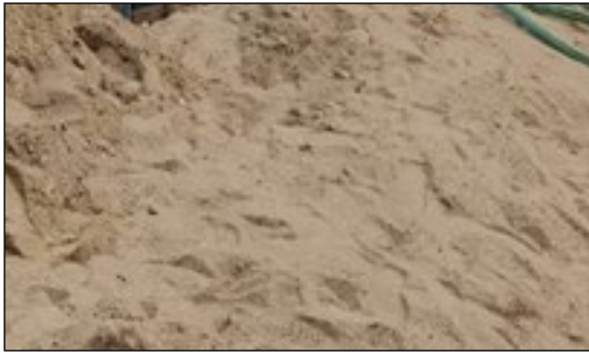
Figure 3. Field observation at site 2

Site 3: The construction work of bed PCC for drain was observed at Mechinagar Municipality, Jhapa. Use of Bhagawati cement was noted and mixing type was manual. The first concrete mixing time was noted as 11:05 AM and the last placing time was noted as 1:14 PM. Elapsed time of 129 minute was calculated by the difference between first mixing time and last placing time. Plasticizer was not used.