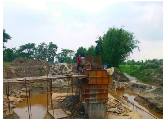
Figure 6. Field observation at site 5

Site 5: The construction work of Bridge abutment was observed at Gauradaha Municipality, Jhapa. Use of Maruti cement was noted and ready mix concrete was used. The first concrete mixing time at RMC plant was noted as 10:43 AM and the last placing time at field was noted as 12:55 PM. Elapsed time of 132 minute was calculated by the difference between first mixing time and last placing time. Plasticizer was used.