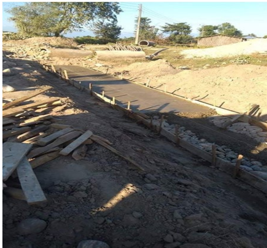
Figure 4. Field observation at site 3

Site 3: The construction work of bed PCC for drain was observed at Mechinagar Municipality, Jhapa. Use of Bhagawati cement was noted and mixing type was manual. The first concrete mixing time was noted as 11:05 AM and the last placing time was noted as 1:14 PM. Elapsed time of 129 minute was calculated by the difference between first mixing time and last placing time. Plasticizer was not used.