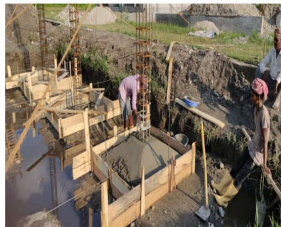
Figure 7. Field observation at site 6

Site 6: The construction work of PCC for footing of building was observed at Arjundhara Municipality, Jhapa. Use of Sarbottam cement was noted and mixing type was manual. The first concrete mixing time was noted as 7:58 AM and the last placing time was noted as 10:02 AM. Elapsed time of 124 minute was calculated by the difference between first mixing time and last placing time. Plasticizer was not used.