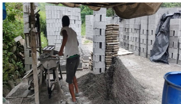
Figure 12. Field observation at site 10