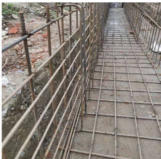
Figure 5. Field observation at site 4

Site 4: The construction work of roadside structure (RCC drain wall) was observed at Birtamode Municipality, Jhapa. Use of Century cement was noted and mixing type was Mechanical. The first concrete mixing time was noted as 8:22 AM and the last placing time was noted as 8:40 AM. Elapsed time of 17 minute was calculated by the difference between first mixing time and last placing time. Plasticizer was not used.